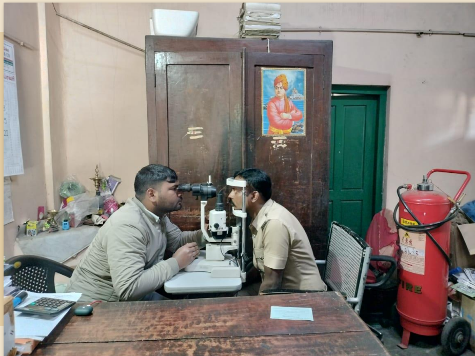
11/02 @ Fire Office Coonoor