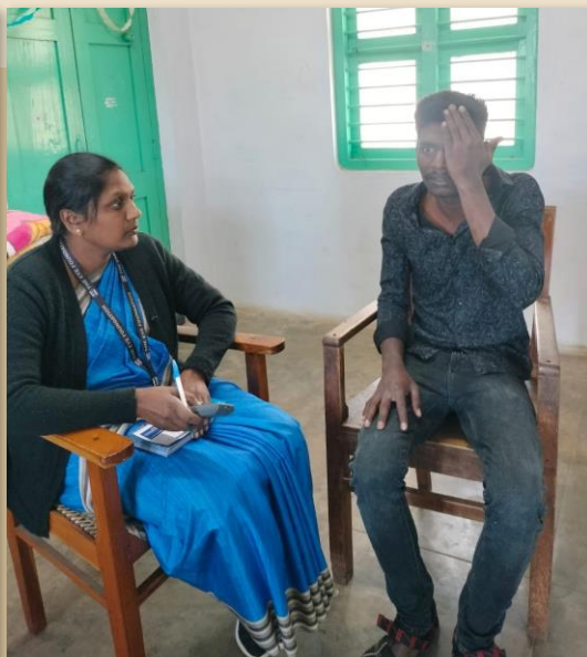
22/02 @ Kerbetta Estate