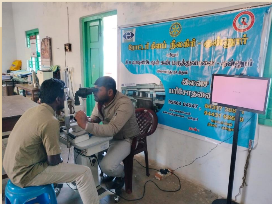
14/02 @ EB Office